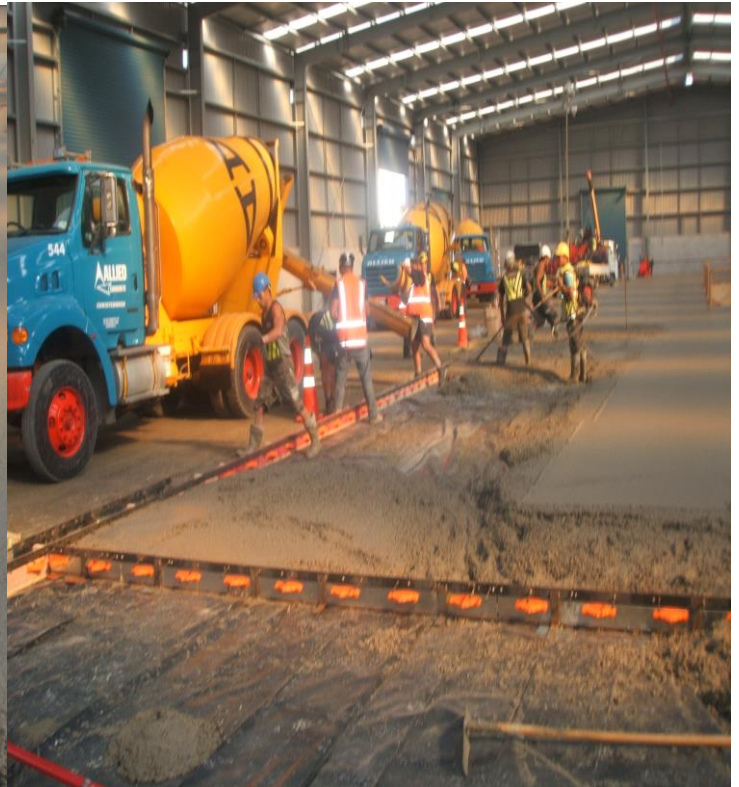
Type B (used in a continuous pour)